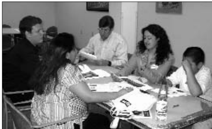
Student-led focus group with neighborhood stakeholders.