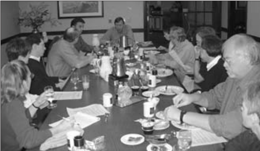
Alumni Council members and faculty.